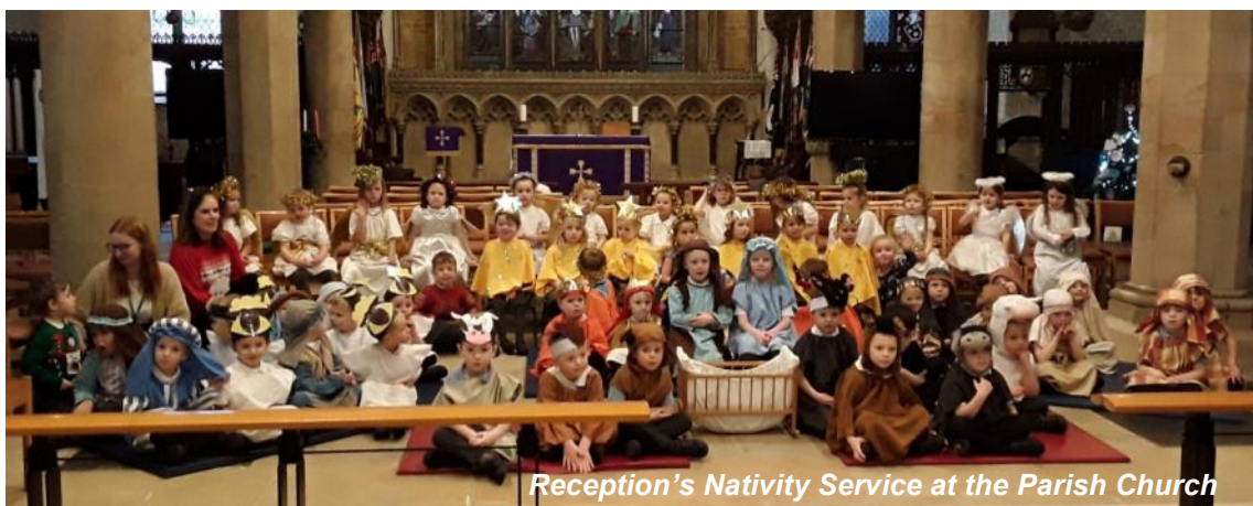
Reception's Nativity Service at the Parish Church