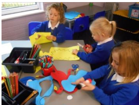
Year 1 pupils are perfecting their cutting out skills.