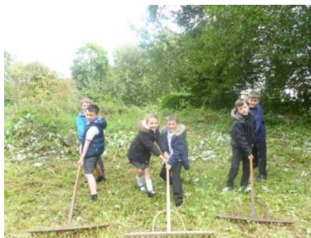
Year 4 pupils look after our pollinator area on the canal path.