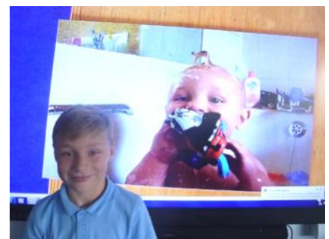
Year 5 pupils are enjoying learning about growth and development.