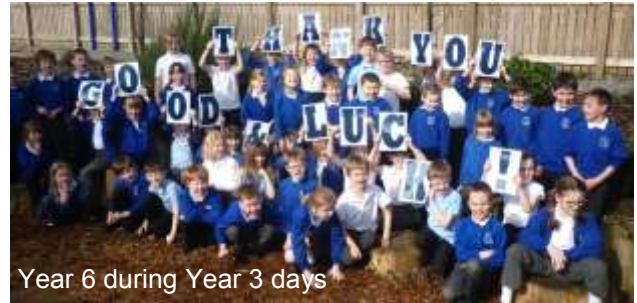
Year 6 during Year 3 days

We wish our Class of 2018 all the very best at their new schools. Their self-portrait shadow drawings, completed during SATs week, are fabulous.