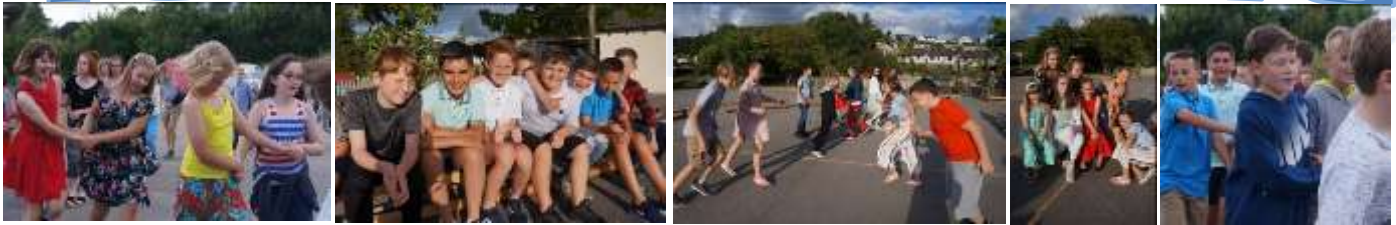
Fun times at the Leavers' barbecue and ceilidh on a magical summer's evening.