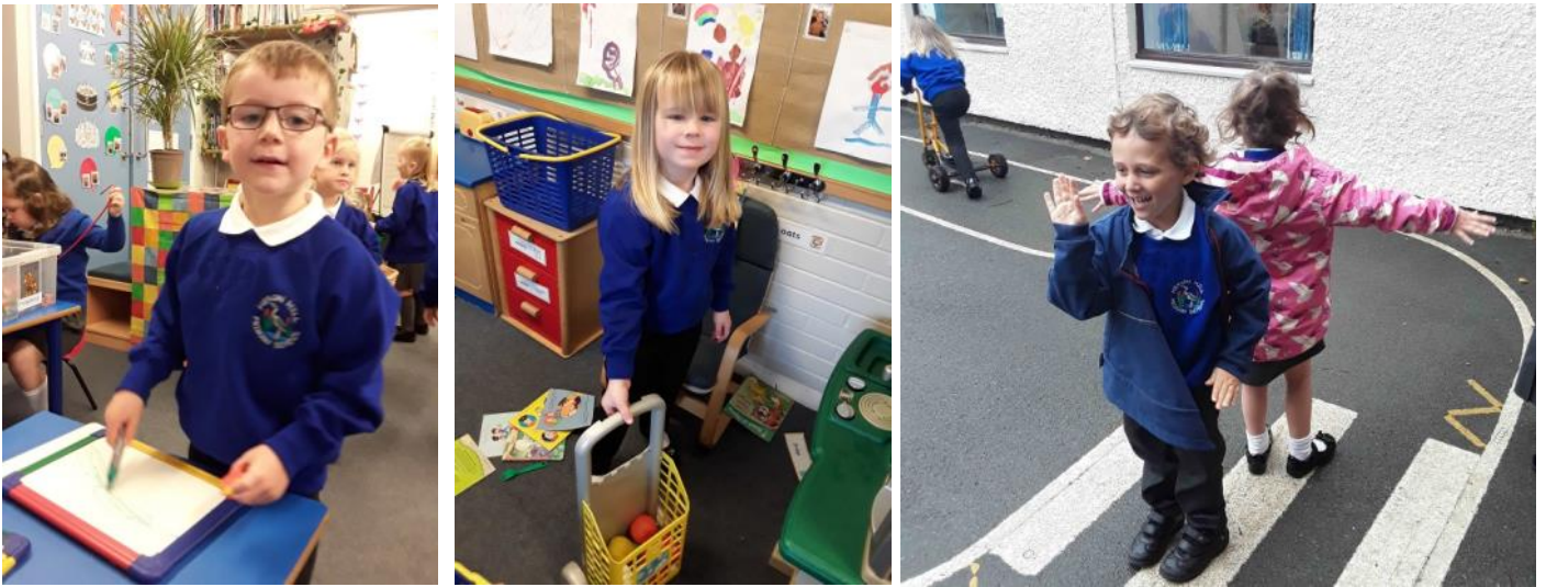
First week in Reception: Our Reception pupils are so smart in their new uniforms.