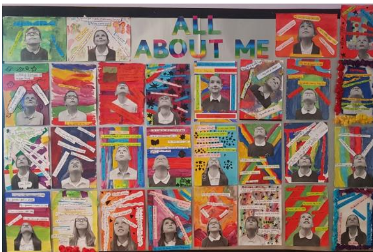
Year 5: Let me introduce myself... Look at this great artwork created by our Year 5s in their first week in school!